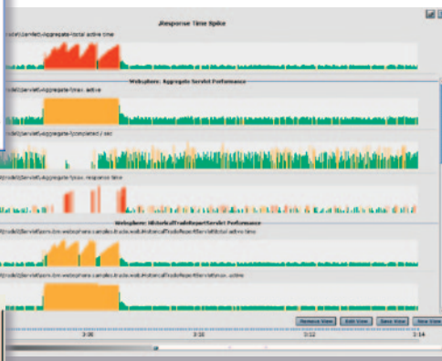
AppInternals Xpert correlates real-time values and historical data to automatically generate sets of related metrics.

AppInternals Xpert™ delivers comprehensive performance management for critical Java and .NET applications, tracking thousands of metrics pertaining to application servers, web servers, databases, and system resources. AppInternals Xpert's unique correlation technology detects patterns in metrics and events automatically. AppInternals Xpert has unique instrumentation technology that allows it to provide in-depth instrumentation of applications with minimal overhead in production environments. Prior to deployment, AppInternals Xpert goes beyond simple load testing to guide QA engineers to the root causes of problems.